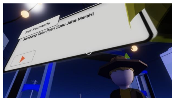
Fig 4. The dialogue display when approaching the food vendor

The interaction options presented to the player during the tour include three key buttons: "View Menu!", "More Information!", and "See Something Else". The "View Menu!" button displays an image-based menu of the products available in the virtual tour. The "More Information!" button provides detailed information about the product, such as its opening hours, available delivery options, and relevant social media links for further updates. Lastly, the "See Something Else" button closes the current dialogue and allows the player to continue exploring other areas or products. This cycle of exploration and interaction repeats as the player moves through the virtual environment.