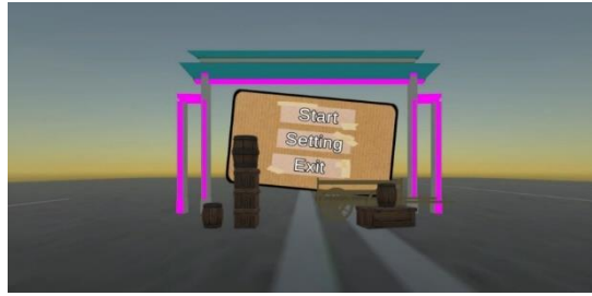
Fig. 2 Menu View

Figure 2 shows the main menu of the Pasar Lama Virtual Tour application. The menu consists of three primary buttons: the Start Button, the Settings Button, and the Exit Button. The Start Button is used to initiate the application and begin the virtual tour of Pasar Lama Tangerang. When clicked, it leads the player to the next screen where the virtual tour commences. The Settings Button allows players to access the audio settings, enabling them to toggle the background music (BGM) according to their preferences. Lastly, the Exit Button provides the option to exit the application entirely. Once the player selects "Start," they are presented with a second informational screen introducing the Pasar Lama Virtual Tour. After acknowledging the screen by pressing "OK," the player is placed into the 3D virtual environment. Here, they are introduced to the tour guide character, who initially appears in the idle state, waiting to interact with the player as they explore the virtual space.