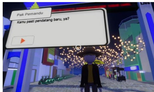
Fig. 3 Character Dialogue Display

As the player approaches the tour guide character, the character enters the talking state and initiates a dialogue, as shown in Figure 3. After the dialogue ends, the player is free to explore the virtual environment. When the player moves, the character transitions to the walking state, following the player while maintaining an appropriate distance. This dynamic interaction is a direct result of applying the FSM model to the character's behavior. If the player approaches a stall, the character pauses its movement, entering the talking state again. The character then provides information about the products available, as shown in Figure 4. Three options appear during the dialogue: