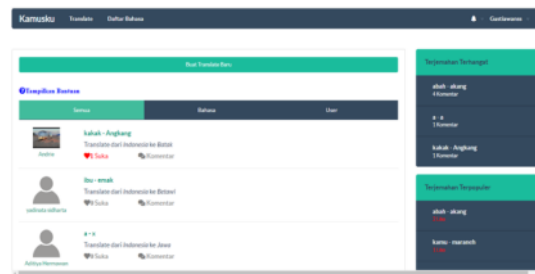
Fig 2. Dashboard

The image display above is a dashboard page from the dictionary application of Regional Languages, where users can directly search for the word they want.