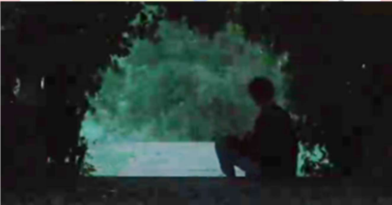
Figure 6.16 Elio waiting for Oliver in the terrazza