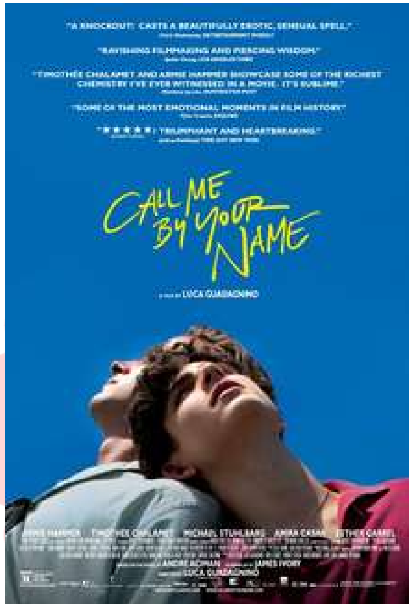
Figure 6.1 Call Me By Your Name (2017) movie poster